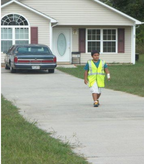
A volunteer placing a handbill at a local residence.