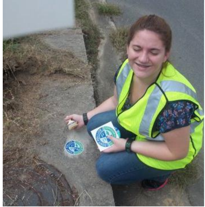
Marking an inlet to make the public aware that it flows to waterways.