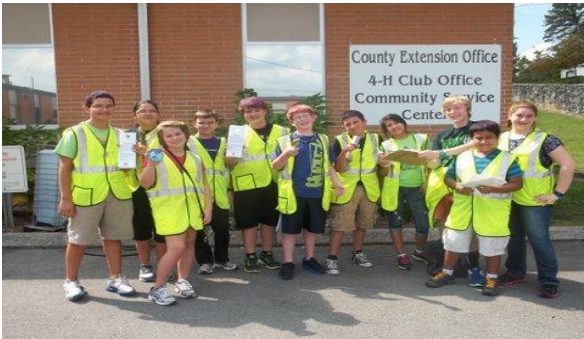
The Volunteers prepared to inform the public of how they can be the solution to stormwater pollution.